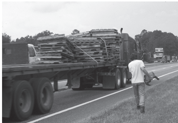
“Large Snapping Turtle is rescued from heavy traffic where Hwy 27 crosses Lake Jackson”

I have been a supporter of the ecopassage from the beginning---it just makes sense. It will provide safe passage for people and safe passage for the animals of Lake Jackson. I’ve encouraged the County and the local transportation planning agency to take advantage of federal DOT grant funds earmarked exclusively to mitigate the environmental impacts of federal highway projects. This project has broad support not only locally, but nationwide. And happily, there is strong support by our local transportation planning agency as well.