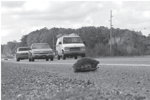
“How does the turtle cross the road?” (Highway 27 crossing - Lake Jackson)